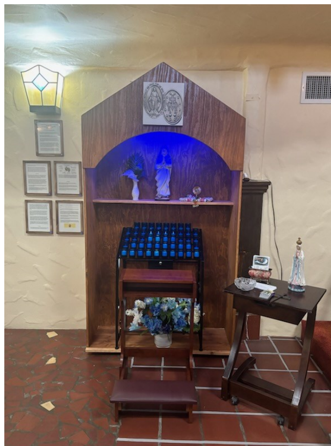
Shrine for our Lady of the Miraculous Medal at St. Teresa of Calcutta Catholic Community Chapel

Mother Teresa of Calcutta would give Miraculous Medals to people she met when she walked this earth. On a visit by an American Buddhist Monk just before her death, Mother Teresa took 10 medals, kissed them, and gave them to him. He gave away 9 medals on his journey and kept one for himself. When he came to live in Largo, Florida, he found St. Teresa of Calcutta Catholic Community and felt his last medal needed to rest at our parish. He presented it to us in 2023.